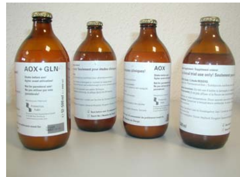
Enteral REDOXS formulas